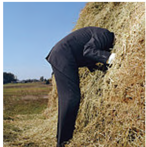
Don't be like this golfer looking for the needle in a haystack!

my physics lessons and laws of circular motion that pivoting around a fixed steady level head allows my club to align itself into the back of the ball without hitting the ground or sculling it down the fairway. By seeing the ball stay still over my left shoulder with no lateral movement of my head and body side to side, closer to or farther away, I can maintain a perfect swing plane, balanced opposition to the club head swinging, and body frame to power the golf swing. I know some people advocate a freedom of movement of the head during the swing, but mine's not moving a lick until the ball is on its way! Rick Bradshaw Award-Winning PGA Teaching Professional G/M, Director of Instruction Dent/Bradshaw Golf School 2004 and 2006 PGA Teacher of the Year (North Florida Section) Heritage Isles Golf & Country Club www.tourexperience.com 813-220-8099