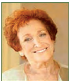
May 17, 1942-August 24, 2018 Abby's Health & Nutrition

creation of the human body and how we live and function largely as a result of nutrition and supplementation.